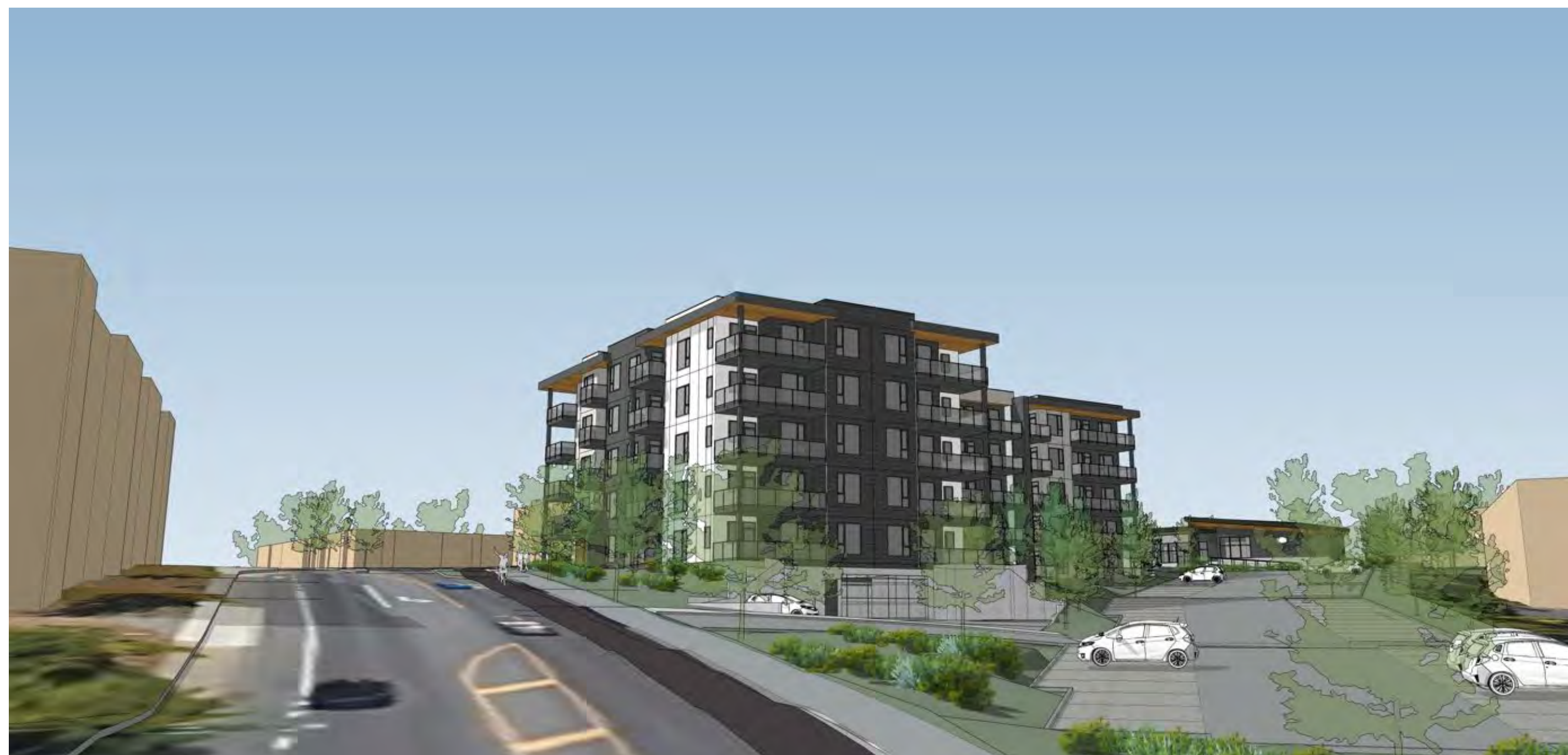
View From Turner Heading South