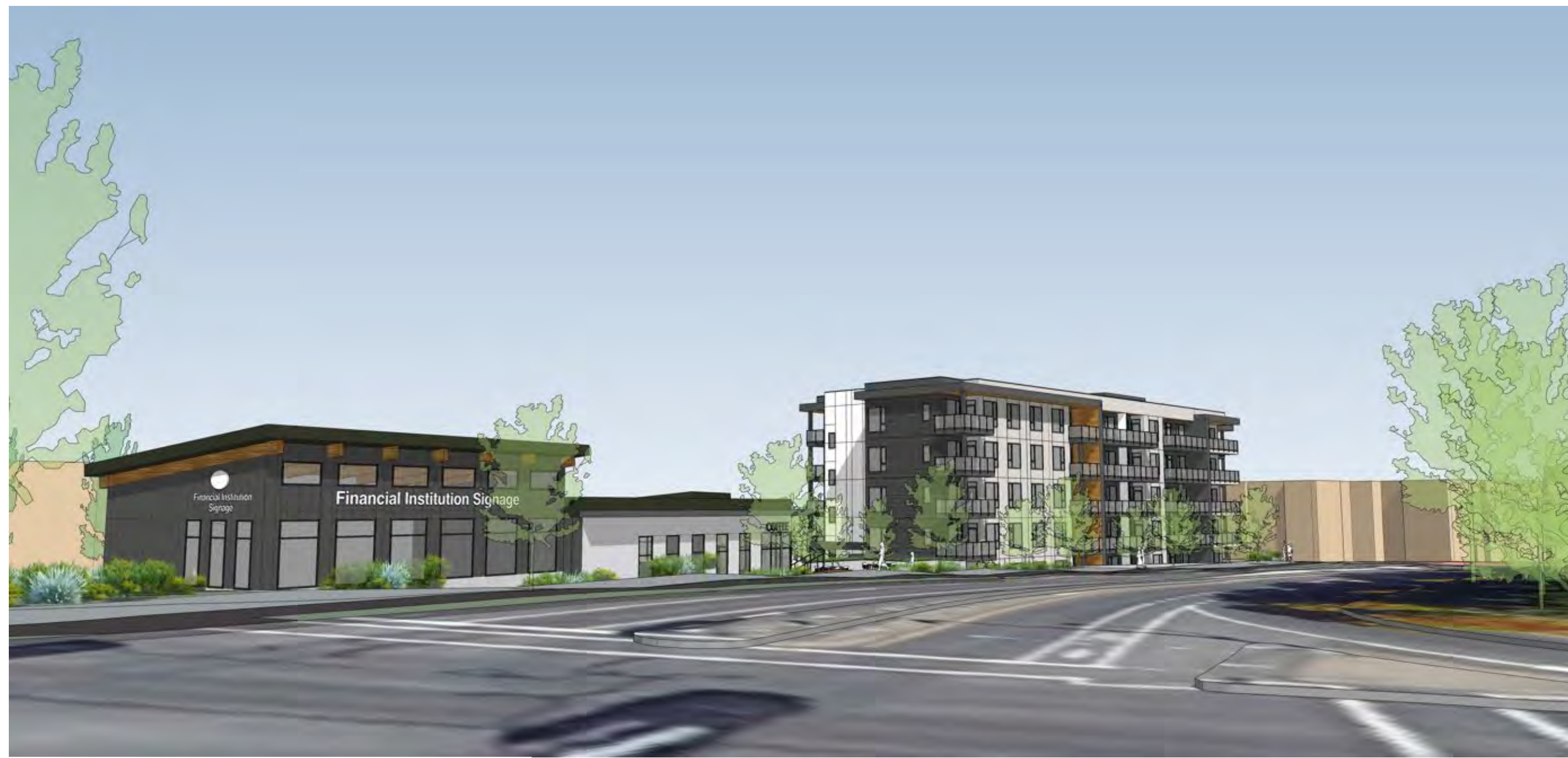
View From Uplands And Turner