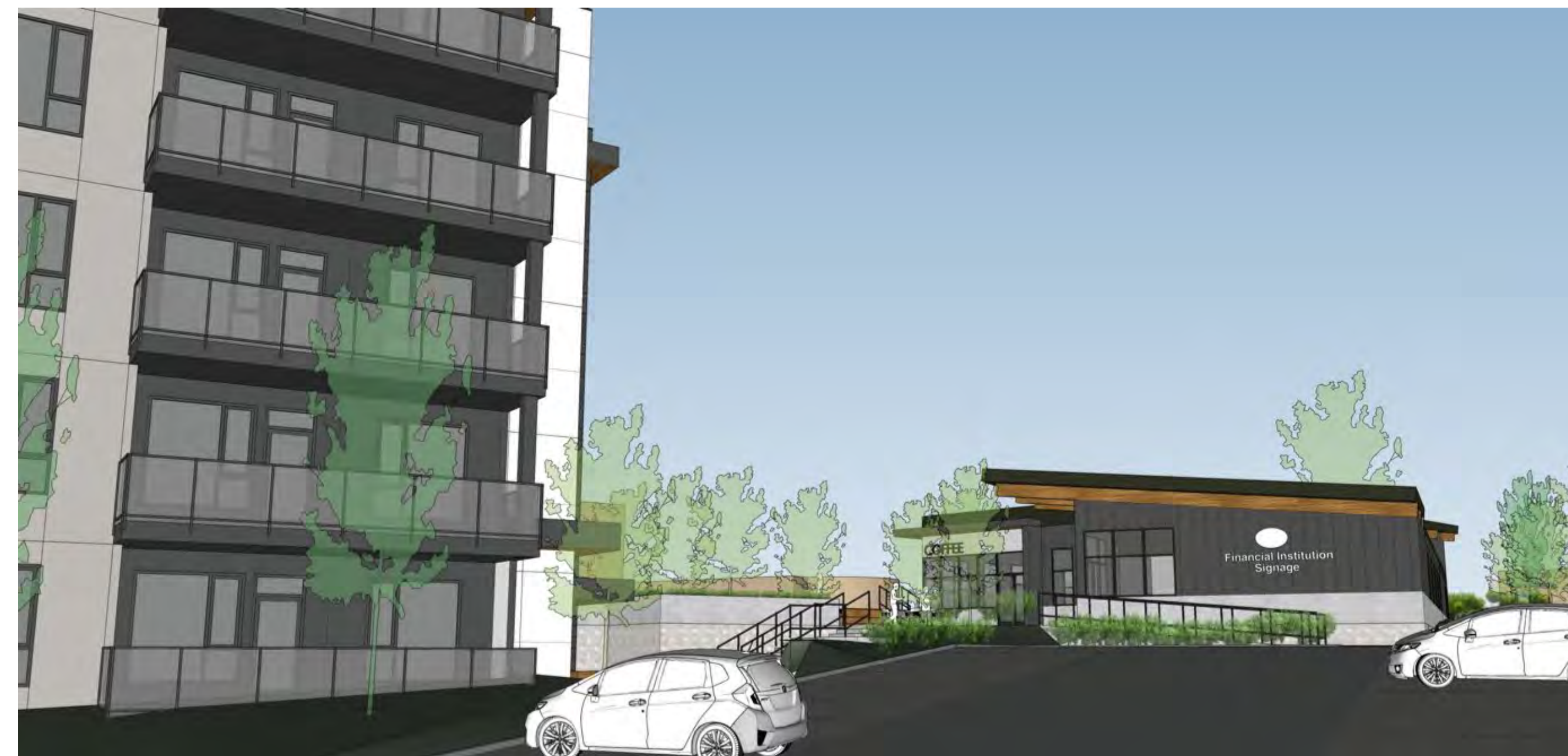
View From Commercial Parking Entry

RECEIVED DP1355 2024-SEP-09 Current Planning