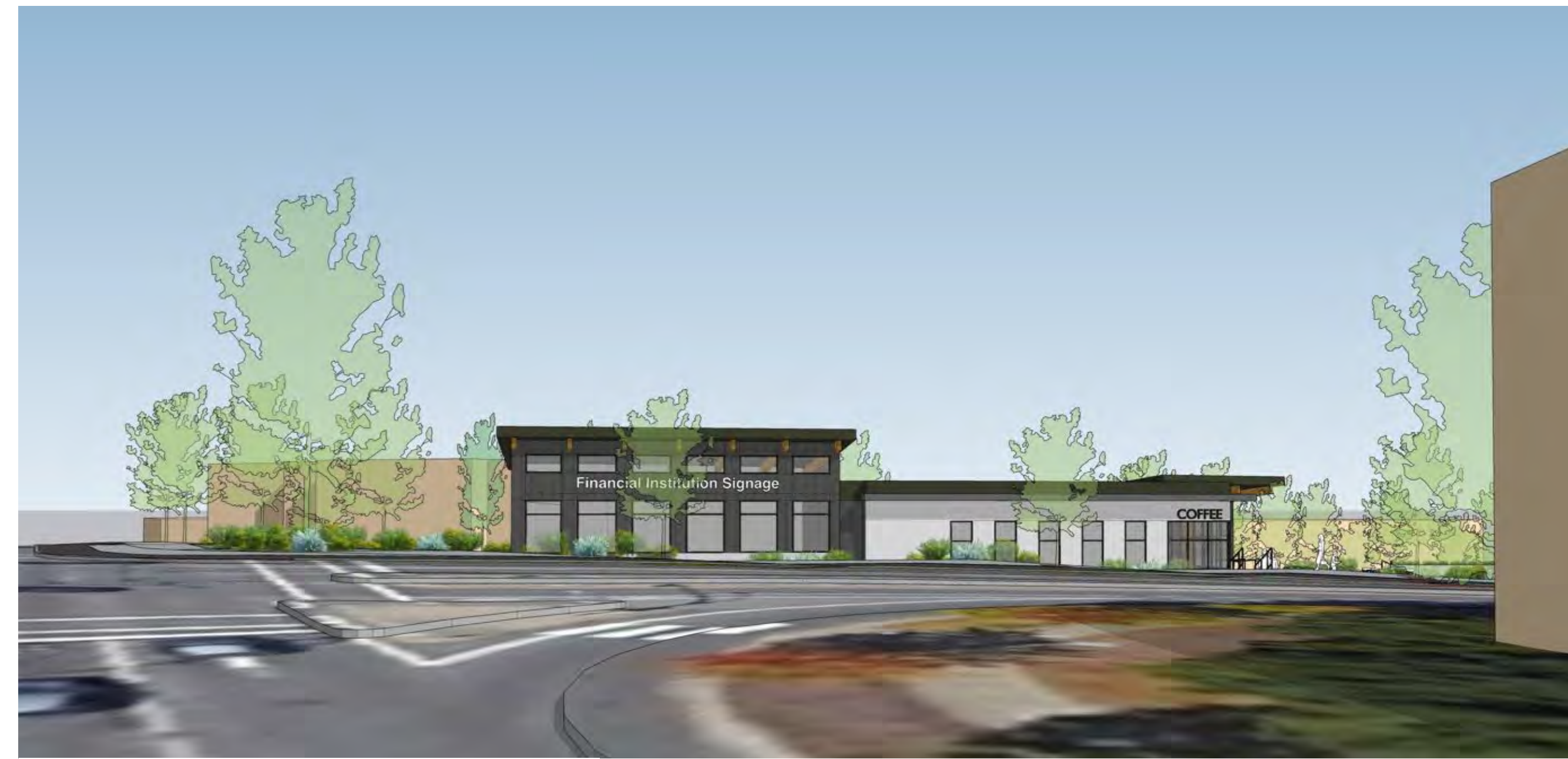
View From Uplands Heading North