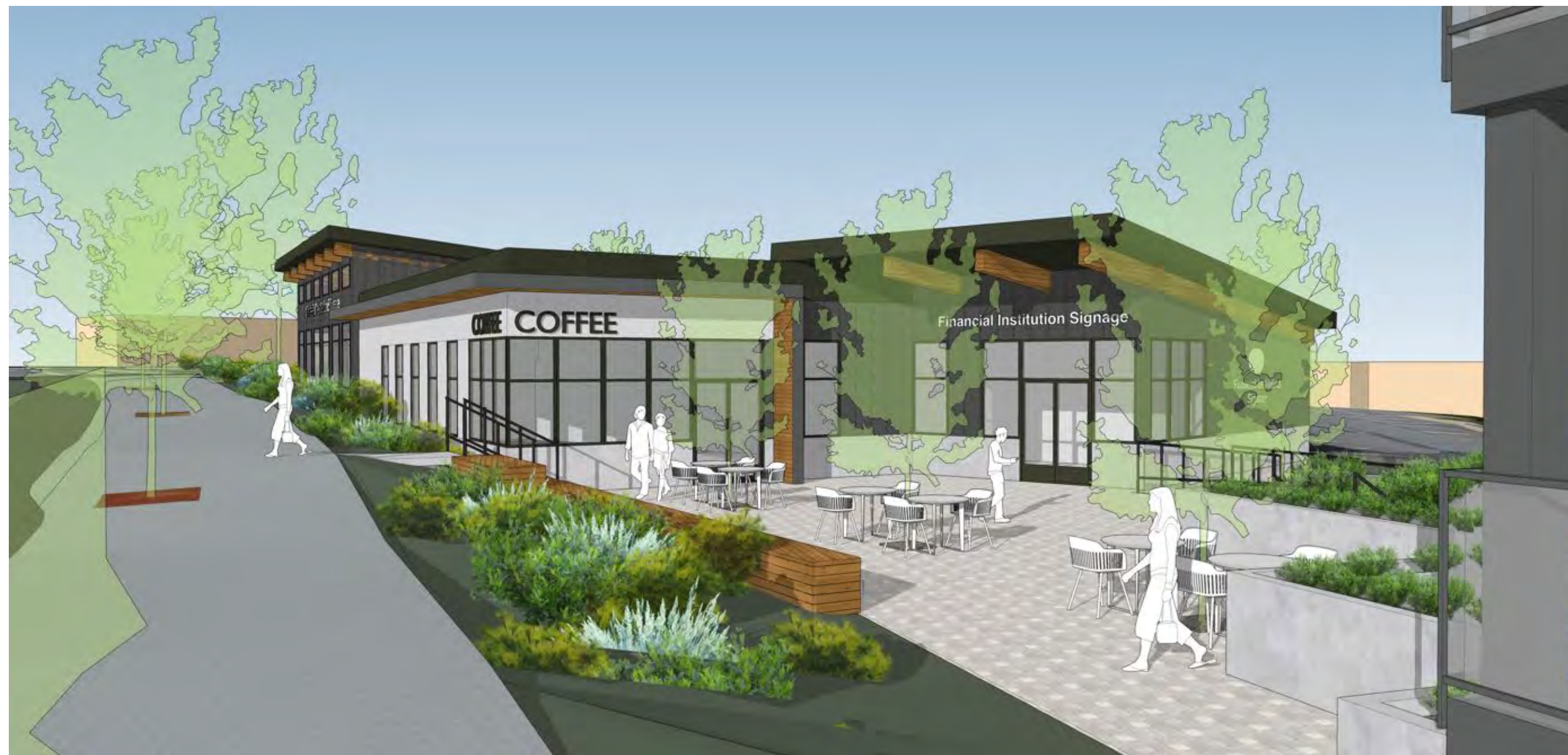
View Of Plaza And Commercial Entry