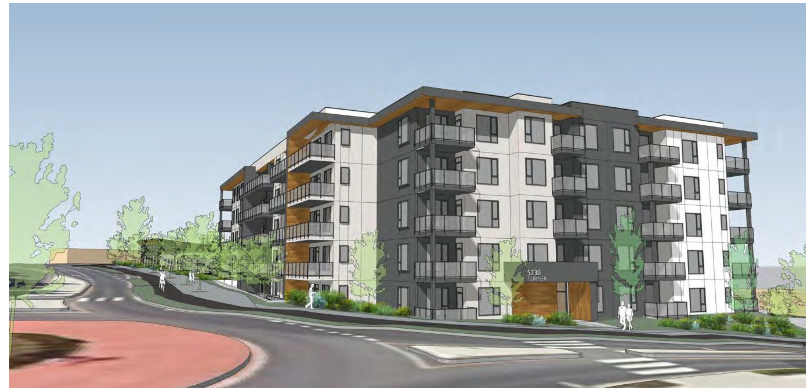
View From Turner Roundabout And Apartment Entry